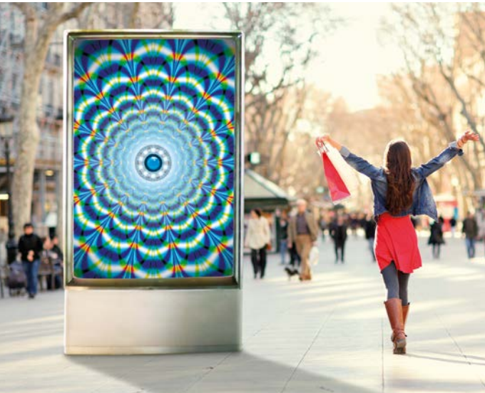
Outstanding print quality on backlit applications