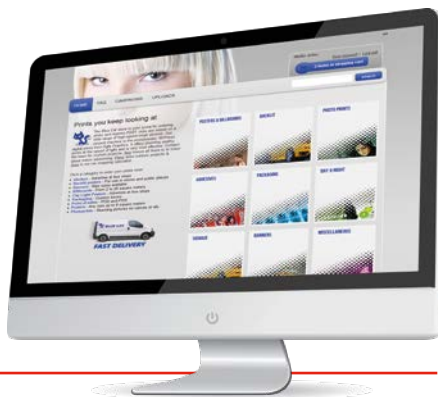
StoreFront web-to-print software