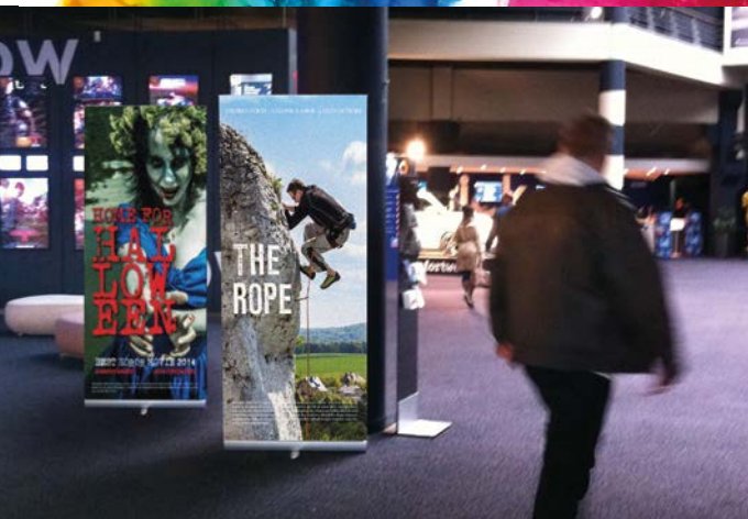
Outdoor communication – vinyl