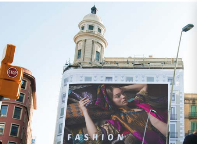
Outdoor communication – vinyl