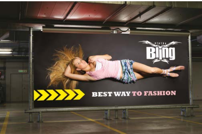
Outdoor communication – vinyl

StoreFront, a comprehensive web-to-print service, is designed to handle incoming orders from the internet. Automated payment processing and error-free print preparation ensure new jobs are ready for printing in no time and with a minimum of operator intervention.