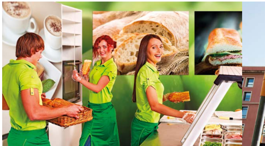
In-store communication – Dibond