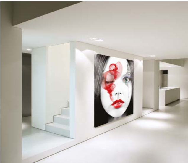
In-house communication – dibond